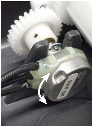
2.5K (+/- 10%) Center Position

After installing new potentiometer, test machine for proper operation.