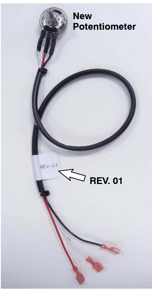
Connect the new potentiometer wire harness to machine wire harness wires as shown (white to 39/white, red to1B/red and black to13AA/black).

When installing the new potentiometer REV 01, connect wires as shown below; white-to-white, black-to-black and red-to-red. REV 00 required this potentiometer to be connected black-to-white, white-to-black and red-to-red for proper operation. DO NOT repeat these connections on the new Potentiometer REV 01.